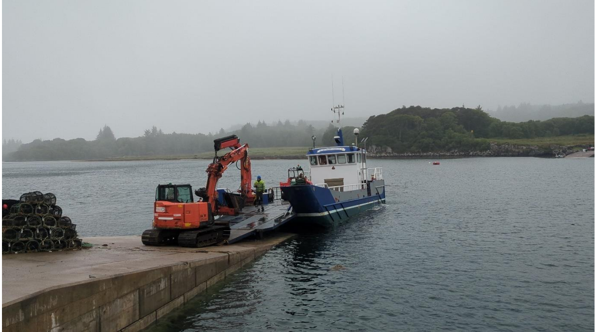
Photo shows an example of a barge which NWMCC hopes to purchase. This particular barge was hired recently to support with a renovation project on the Isle of Ulva. The hire cost was c.£2,700 (3 hours of usage).