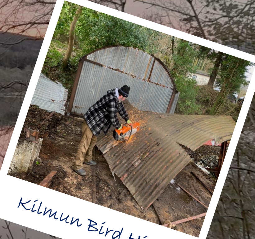
Kilmun Bird Hide