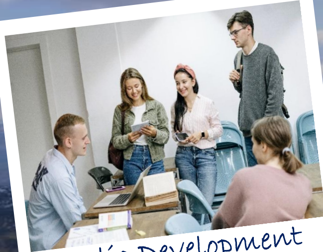
Gaelic Development programme and hubs

Fàilte a chur air Earra- Ghàidheal is Bhòid