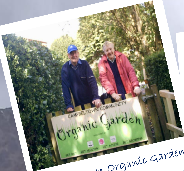
Campbeltown Organic Garden