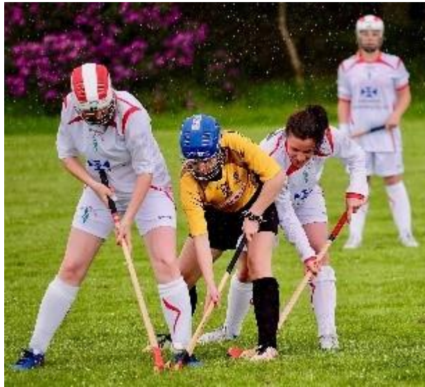
Bute Shinty Club, Ladies Section