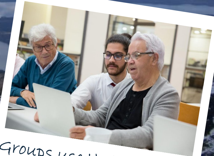
Groups use their skills to make positive change