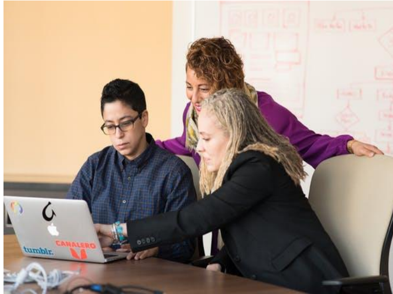
Network opportunities & regular Communities Bulletins